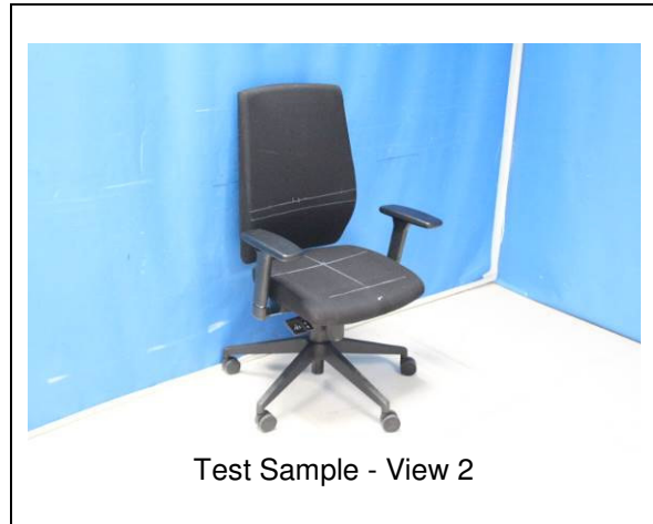
Test Sample - View 2