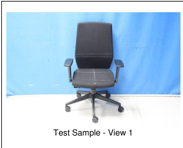
Test Sample - View 1