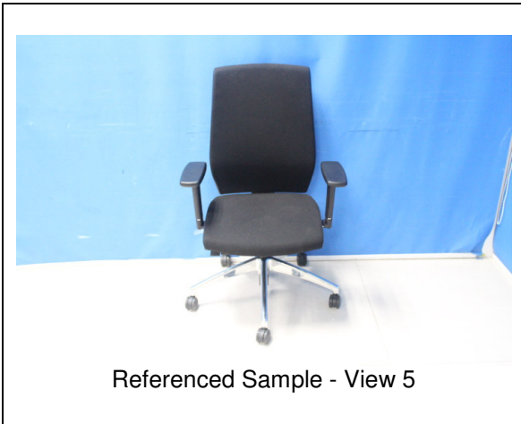
Referenced Sample - View 5