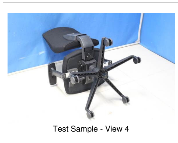
Test Sample - View 4