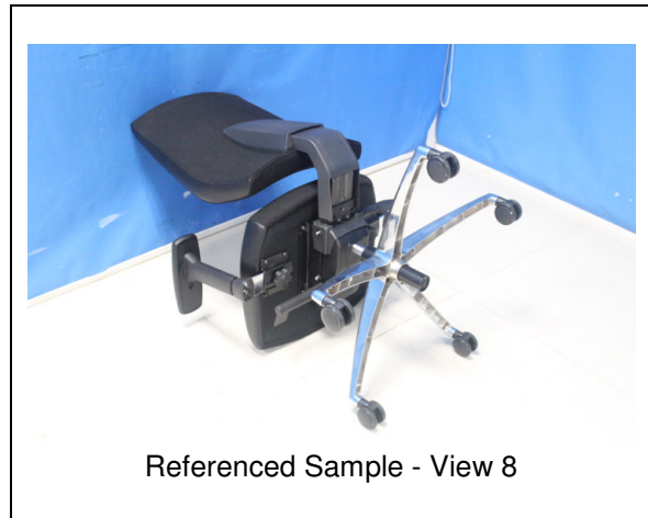
Referenced Sample - View 8