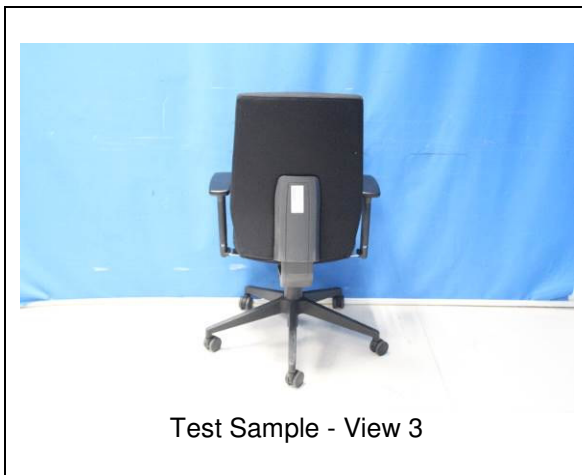
Test Sample - View 3