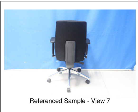
Referenced Sample - View 7