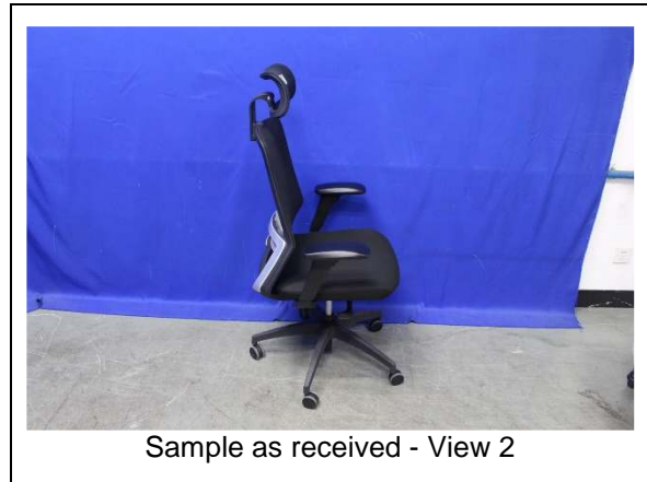
Sample as received - View 2