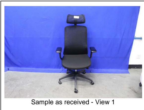
Sample as received - View 1