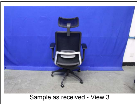
Sample as received - View 3