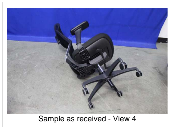
Sample as received - View 4

SGS authenticate the photo on original report only